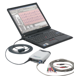
PC-Based Resting ECG

Manage patient data and compare tests with CardioPerfect® software