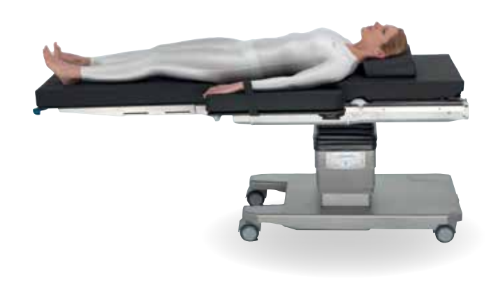
Efficient preoperative and postoperative positioning for lithotomy.