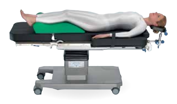
OPHTHALMOLOGY AND ENT Ophthalmology and ENT – head rest system.