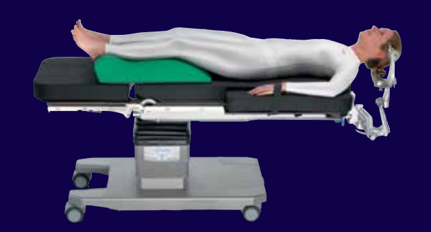
Craniotomy in the supine position.