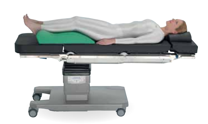
Lithotomy position for gynecology and urology.