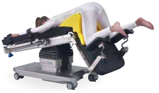
GENERAL SURGERY Jackknife position.