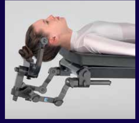
Skull clamp with 360° X-ray capability for neurosurgical applications.