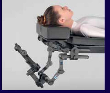
Patient initiation for neurosurgery.