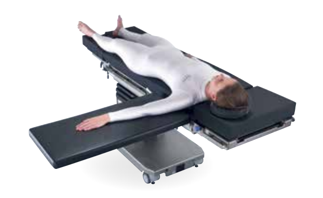
TRAUMATOLOGY AND ORTHOPEDICS

Carbon fiber hand table for traumatological surgery to the upper extremity.