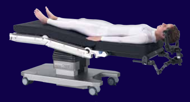
Extended carbon fiber component for greater imaging access.