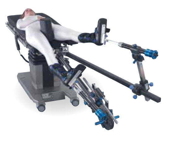
TRAUMATOLOGY AND ORTHOPEDICS

Extension unit for hip replacement, arthroscopy and femur fractures.