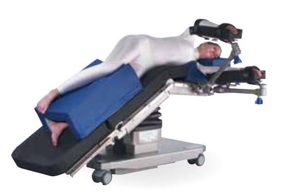
GENERAL SURGERY Lateral position for kidney surgery.