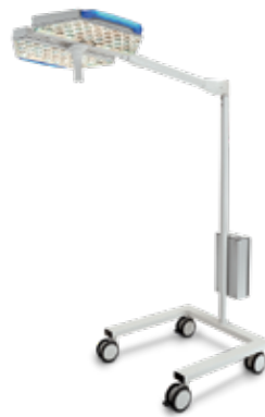
Mobile version: for emergencies or supplemental use