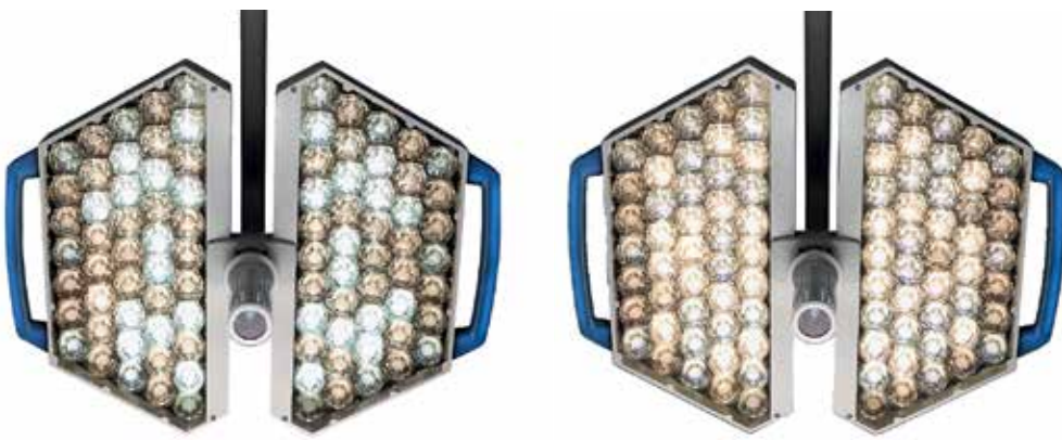
Contrast optimisation due to colour temperature adjustment of 3,500 to 5,000 K

Every generation has an edge over the previous one. Similarly, in the case of the TL5000 Surgical Light, proven functionality meets technological advancements that have significant impact on the quality of work in the OR. Equipped with adjustable colour temperature and pattern size adjustment, the TL5000 Surgical Light offers an exceptional performance range that benefits you during daily use.