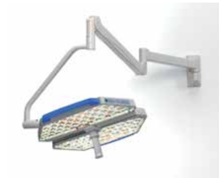
Wall-mounted version: ideal for special infrastructure conditions and procedures